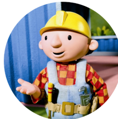
testing Tester TESTER

bfish@altahl.com M: 904.307.2970 altahl.com 3216 Napier Park Dr. Ste 108 San Antonio, TX 78231